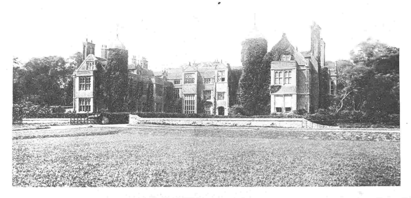
KENTWELL HALL, LONG MELFORD.