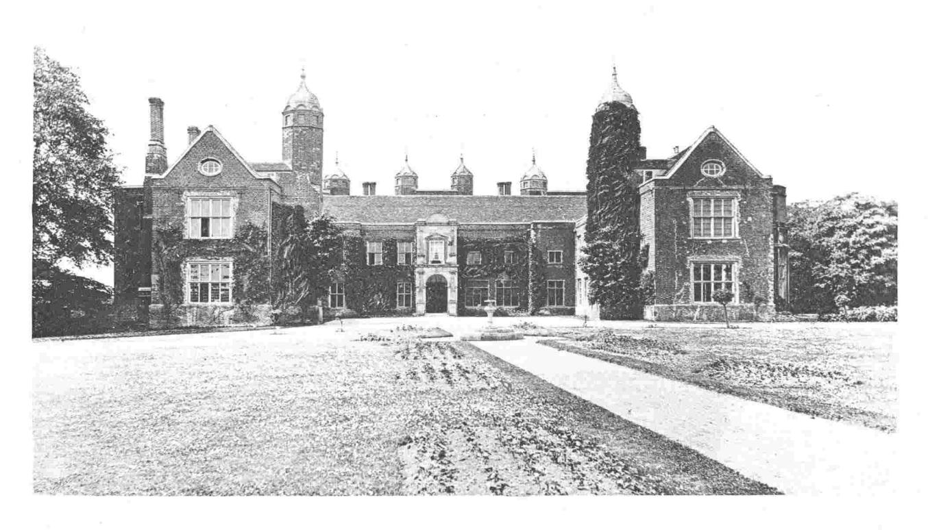
LONG MELFORD HALL,