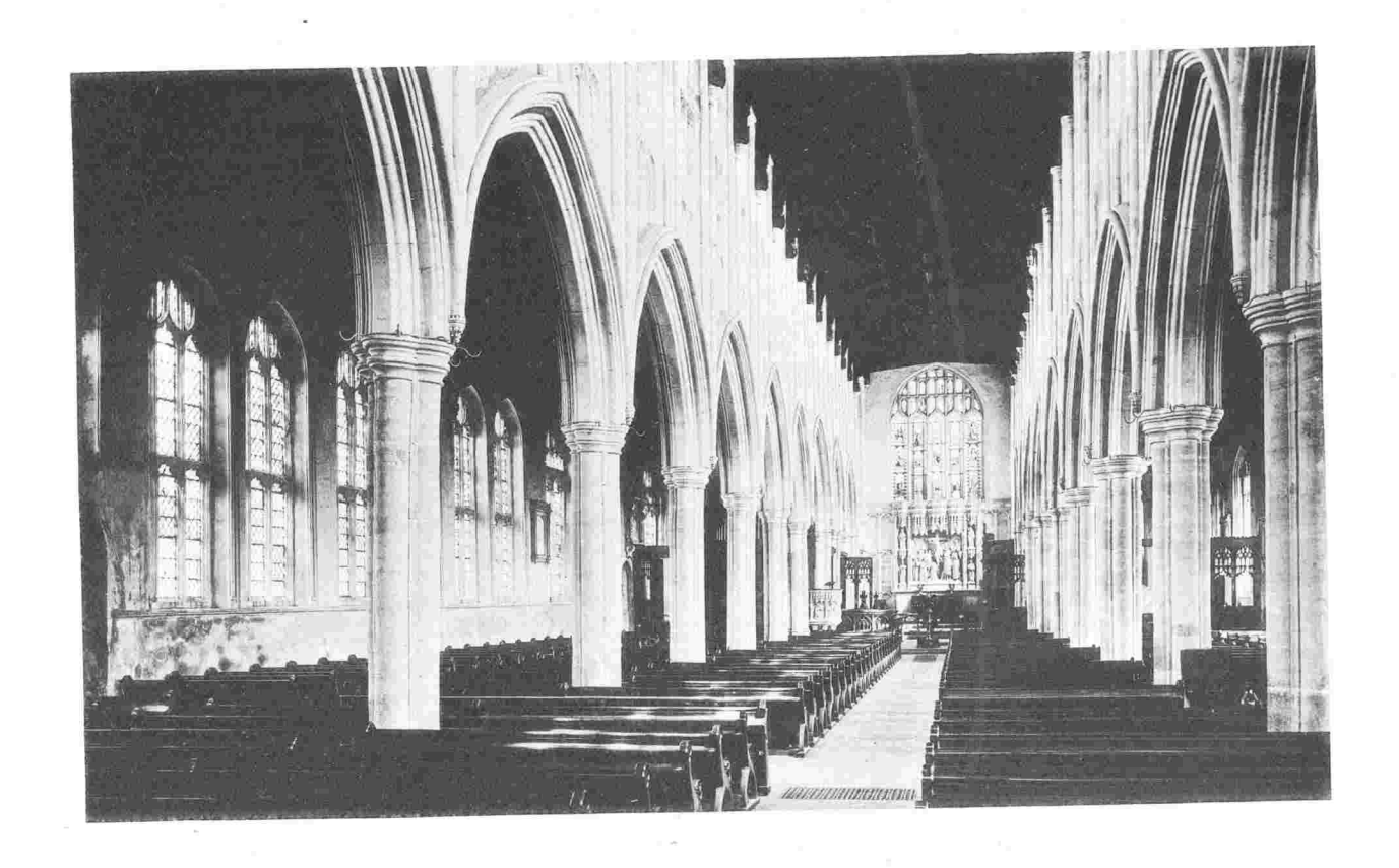
LONG MELFORD CHURCH.